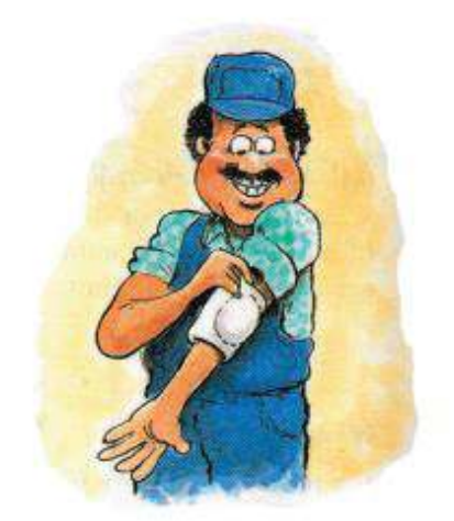
Your dressings will be changed during a follow-up visit.