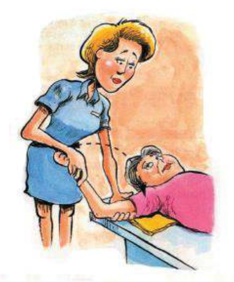
Increasing flexion and extension range of motion

You will have a referral for a program of exercise and other therapy beginning as early as the first week after surgery. Designed to get you back to normal activities, your personalised program is tailored to your specific type of elbow problem and surgery. Stretches will help restore your elbow's range of motion. When it is comfortable for you, your physiotherapist will teach you strengthening exercises.