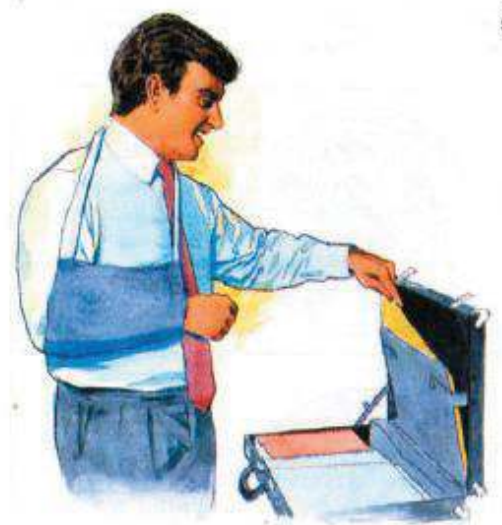
The sling will help reduce pain by resting the joint.

Elevating your arm and moving your fingers will help keep the swelling down. You may need some pain medication after surgery