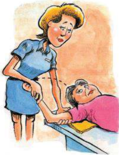
Increasing flexion and extension range of motion

You will have a referral for a program of exercise and other therapy beginning as early as the first week after surgery. Designed to get you back to normal activities, your personalised program is tailored to your specific type of elbow problem and surgery. Stretches will help restore your elbow's range of motion. When it is comfortable for you, your physiotherapist will teach you strengthening exercises.