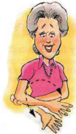
Increasing rotational and range of motion