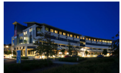
New rooms opposite Campbelltown Private