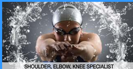
SHOULDER, ELBOW, KNEE SPECIALIST