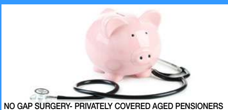
NO GAP SURGERY- PRIVATELY COVERED AGED PENSIONERS