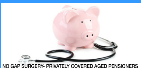
NO GAP SURGERY- PRIVATELY COVERED AGED PENSIONERS