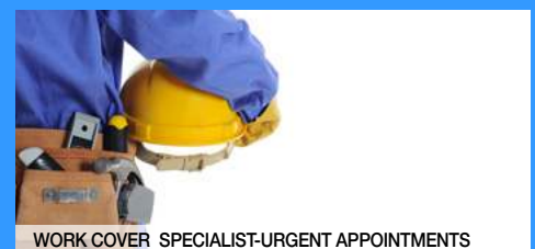
WORK COVER SPECIALIST-URGENT APPOINTMENTS